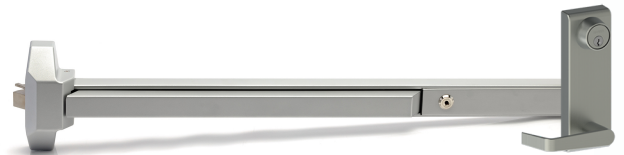
GRADE 1 EXIT DEVICE WITH TRIM