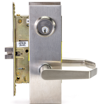
GRADE 1 MORTISE LOCK W/ DEADBOLT