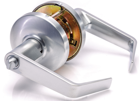
GRADE 1 CYLINDRICAL LOCKSET