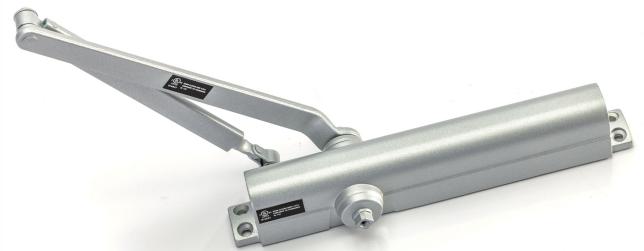
GRADE 1 DOOR CLOSER W/ PARALLEL ARM